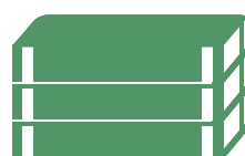
3 Hours Professionalism